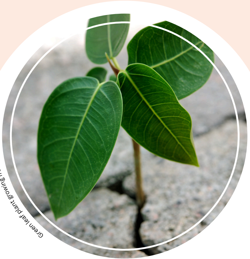
Green leaf plant growing from a crack in the ground