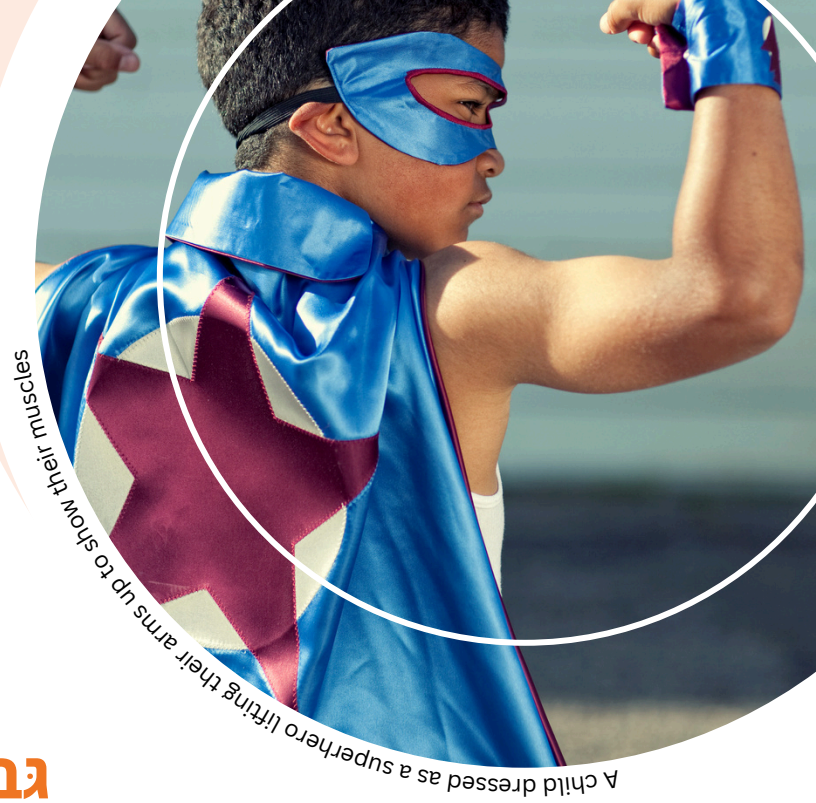
A child dressed as a superhero lifting their arms up to show their muscles